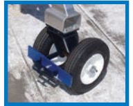
Optional dual pneumatic tires

With systems as light as 116 pounds, just one worker can typically carry, assemble, and precisely position a Spanco Aluminum Gantry Crane almost anywhere — including rooftops. Designed to easily fit into or on top of most service trucks, these lightweight gantries carry up to 3 tons and are popular with contractors and in the HVAC industry.