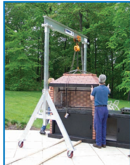
A 2-ton Spanco Aluminum Gantry Crane lifting the top portion of a grill for quick assembly.