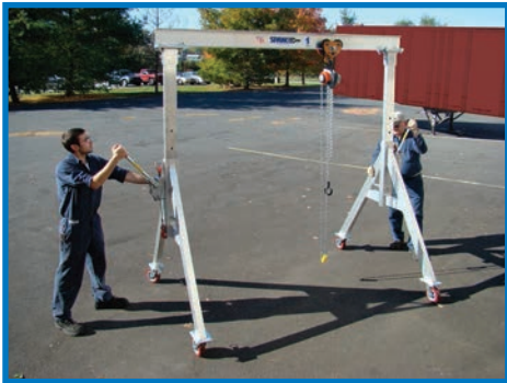
Two workers adjusting the height on an aluminum gantry crane using a Lug-All Winch Hoist.

Height adjustment via spring-loaded, steel locking pin